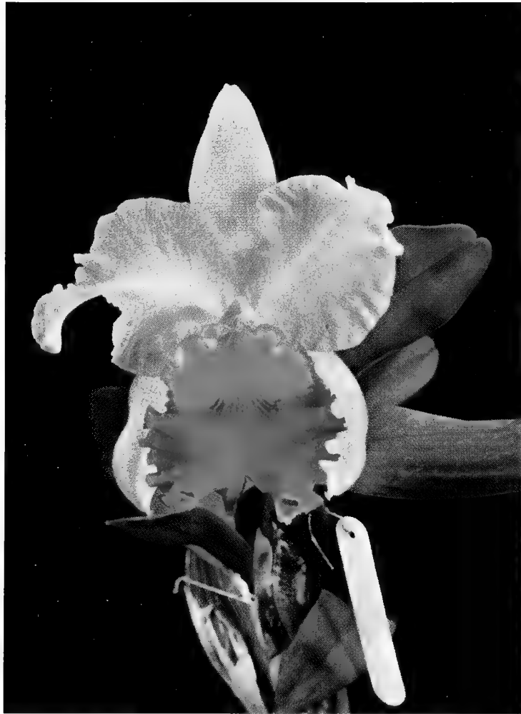
Cattleya Famosa , variety Heritage